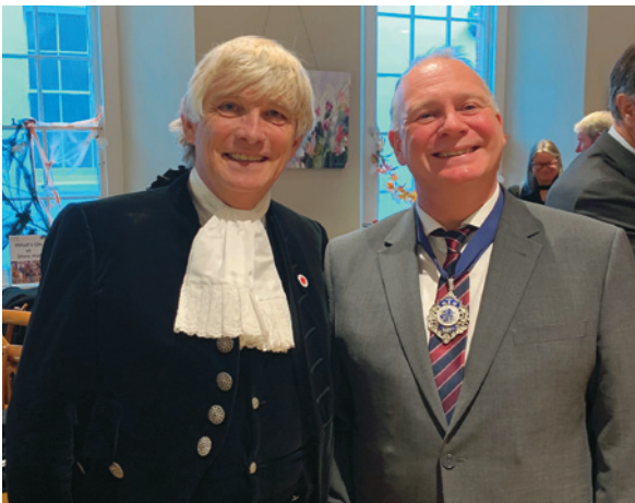
Dorset Legal Service