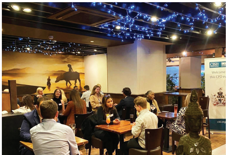
BDJLD and CISI Speed-Networking