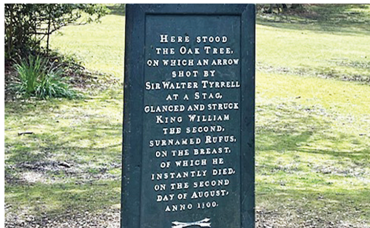
Rufus Stone, New Forest