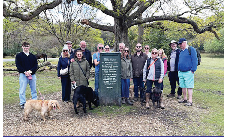
The walkers at Rufus Stone