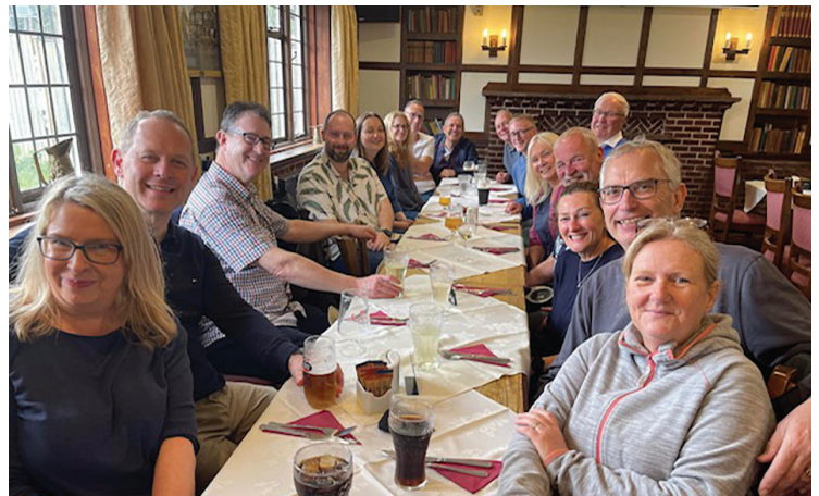
The group enjoying a well-earned lunch at Sir Walter Tyrrell